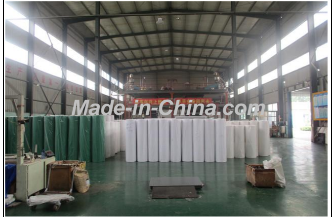
Description: Workshop Inside