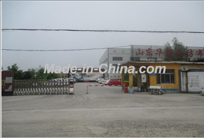
Description: Company Gate